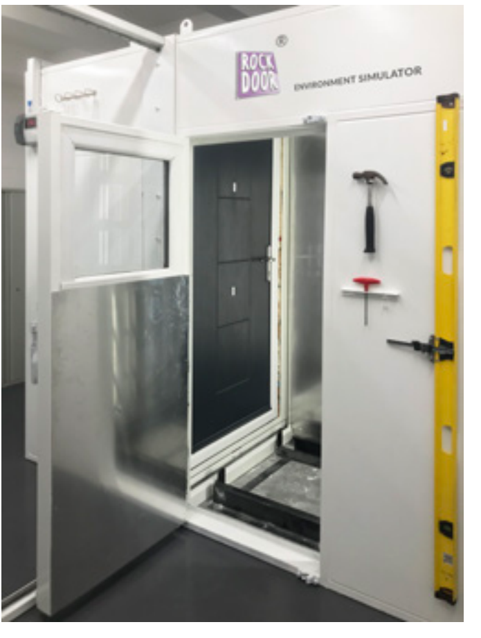
A Rockdoor in position and ready to be tested to the extreme